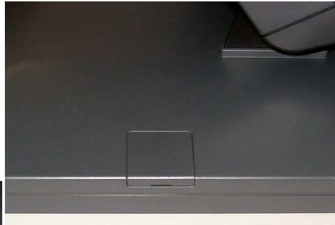
MSR connector cover

On the rear, left side of the LCD display, remove the cover by inserting a fingernail into the slot and prying the cover off. See picture right. Remove the cover and find the connector inside; see picture below.