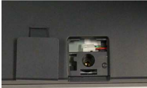
MSR connector cover removed