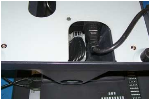
Figure 1, 2100 Power Cord Attachment

Plug the supplied AC cord into the power adapter mounted into the base. See photo below. Stand the system on its feet and snake the power cable through the cutout in the rear of the base.