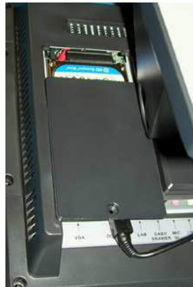
Figure 4, 2100 HDD seen under open door