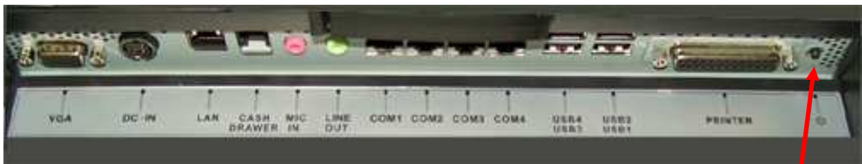
Figure 2, 2100 POS I/O Panel

WARNING: To avoid accidental power-up during installation, connect the AC Power Cable last.