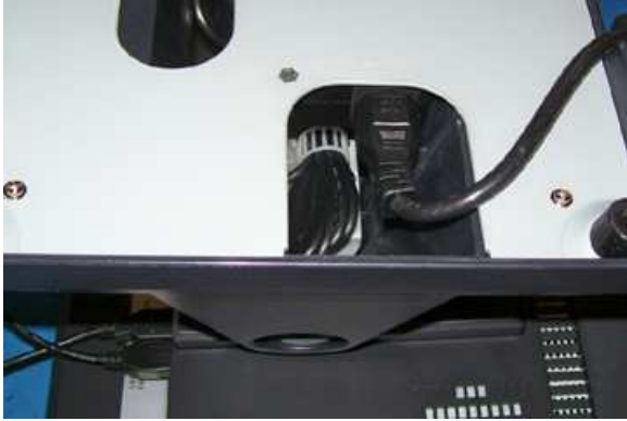
Figure 3, AC Power Cord Attachment

Plug the supplied AC cord into the power adapter mounted into the base. See photo below. Stand the system on its feet and snake the power cable through the cutout in the rear of the base.