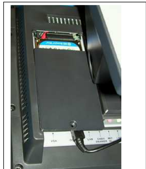
Figure 4, HDD seen under the opened door