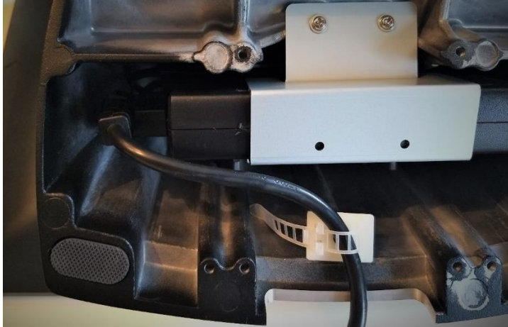
Figure 3, AC Power Cord Attachment

See photo below. Stand the system on its feet and be sure to position the power cable through the cutout in the rear of the base.