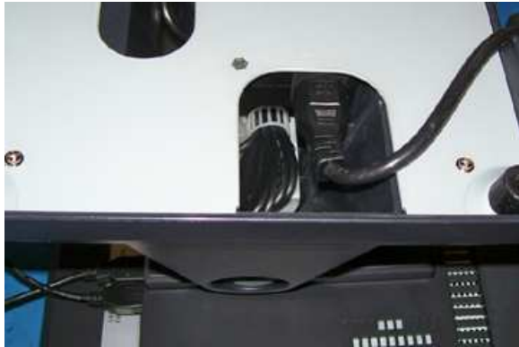
Figure 3, AC Power Cord Attachment

Plug the supplied AC cord into the power adapter mounted into the base. See photo below. Stand the system on its feet and snake the power cable through the cutout in the rear of the base.