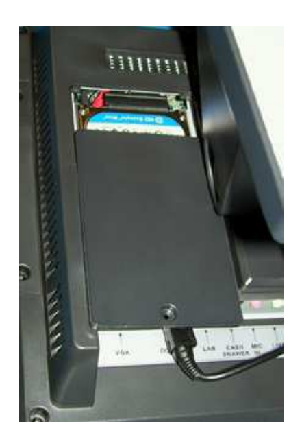
Figure 4,2170 HDD seen under open door