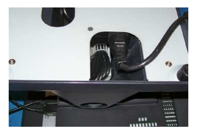
Figure 1, 2170 Power Cord Attachment

WARNING: To avoid accidental power-up during installation, connect the AC Power Cable last.