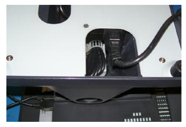
Figure 3, AC Power Cord Attachment

Plug the supplied AC cord into the power adapter mounted into the base. See photo below. Stand the system on its feet and snake the power cable through the cutout in the rear of the base.