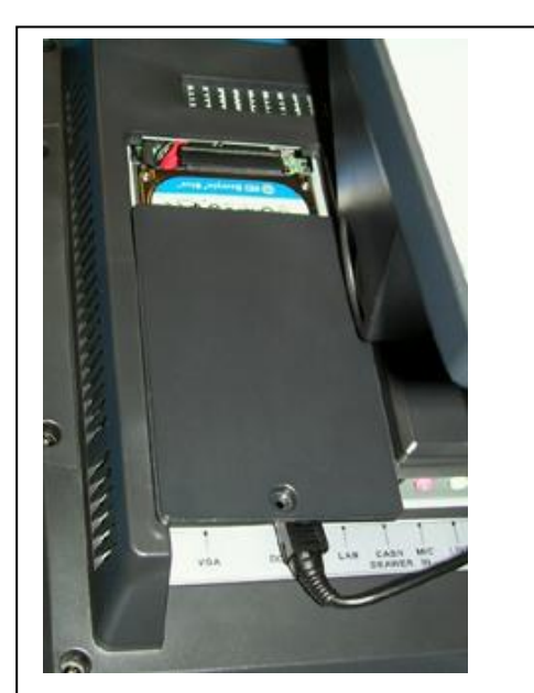
Figure 4, HDD seen under the opened door