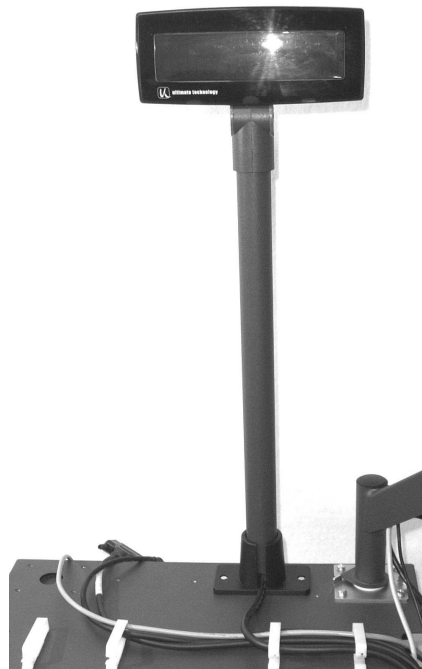
Figure 1: POS System